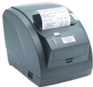
Logo print & Auto cutter