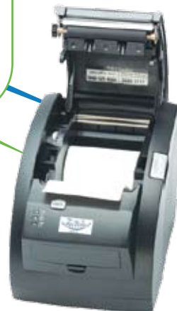
Easy paper loading