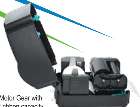
Dual Motor Gear with 300 M ribbon capacity

If you run a Grocery Store, you'd need to print Price Labels, Shelf Tags, Bag Delivery Labels, etc. If it is a Jewellery shop you'd need Ring Labels, Custom Order Labels, while a Warehouse needs Barcode Labels, Address Labels, Shipping Labels, etc. Be it the hospitality or healthcare label printing is essential. Whatever be the labelling requirement, there's one printer that meets it all with great speed - Jus'Print Label Printer. Giving your customers all the info they need at a glance. Leaving nothing to chance.