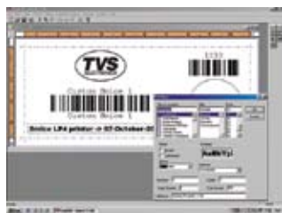
Bartender Software to design your own labels