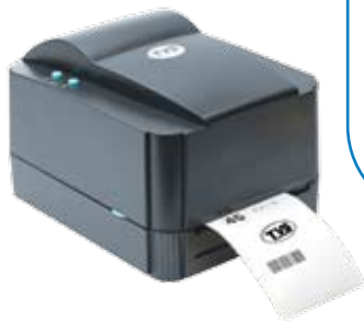
Prints upto 4 inch wide labels