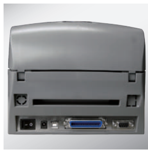
Free USB cable and sample media included with every printer