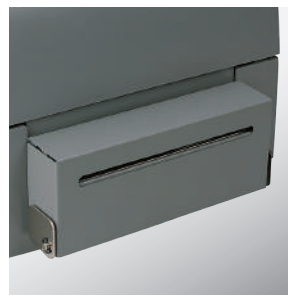
Options include: rotary cutter, label dispenser, CF card adapter with RTC, and Ethernet card