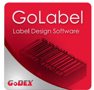
Free GoLabel label design software for ease of use and maximizing barcode printing efficiency